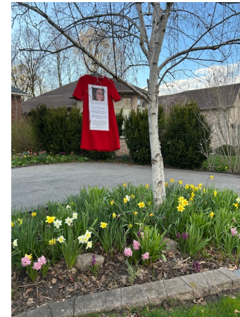
50 dresses were displayed around Wilmot Township on Red Dress Day, May 5 th .

Thank you so much for the invitation to present information regarding Red Dress Day at the Adult Learning session on Sunday, May 3 rd . As members of the Wilmot Indigenous Relations Interfaith Working Group (WIRIWG), we were honoured to share our learning about and our efforts regarding Red Dress Day.