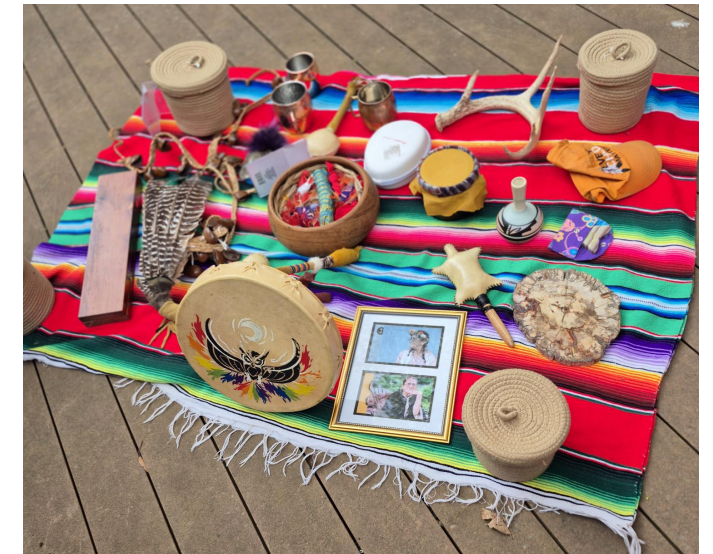
The smudging bundle used in the smudging ceremony.

more than 10,000 views on the "What's Up Wilmot" Facebook page.