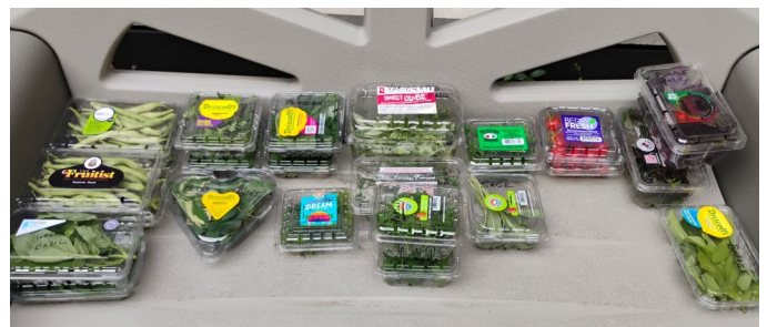
A sampling of our summer courtyard bounty.

Here a Trinity we have accomplished a few actionable items, alongside our financial tithing goal of $2,800 to restore 56 acres around Lake Chad: