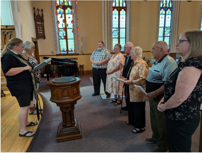
Welcoming six new members.