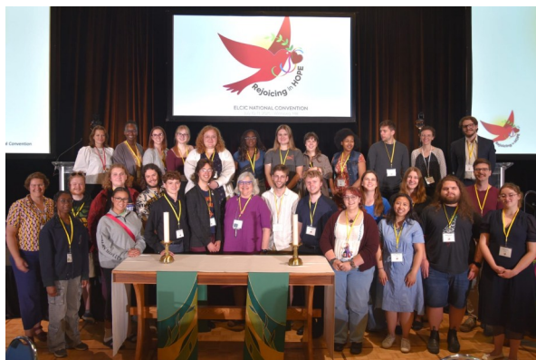
All the Young Adult representation at ELCIC National Convention with Bishop Susan.

younger voices are uplifted and included in the decision-making processes of our church. Taking part in this step toward greater representation was an empowering experience and highlighted the vital role that young people play in shaping the church today and into the future. It was also so great to see the overwhelming support all the other delegates were giving to us, not only were we given a seat at the table, but we were enthusiastically welcomed. Something a delegate from Northern Manitoba said stuck with me, that not only are the youth the future of the church, but we are its present.